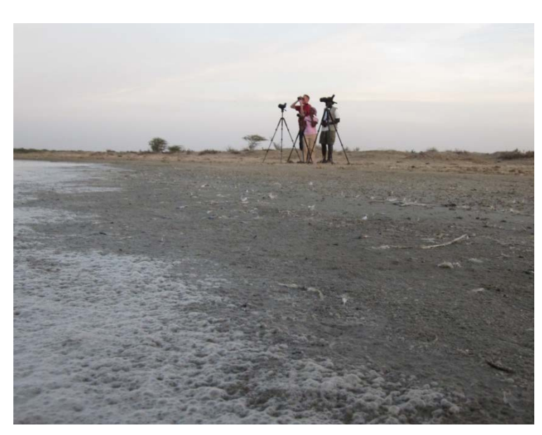
Figure 2 Reading colour rings with Khady Gueye at Cuvette de Ngaye Ngaye.

meeting we travelled towards Guembeul NP; at 4 o'clock we reach this area after a 6 hour drive. The places we checked (Cuvette de Ngaye Ngaye Figure 1 ) are the last part of the Senegal River Delta and fed by a mixture of fresh, sea and