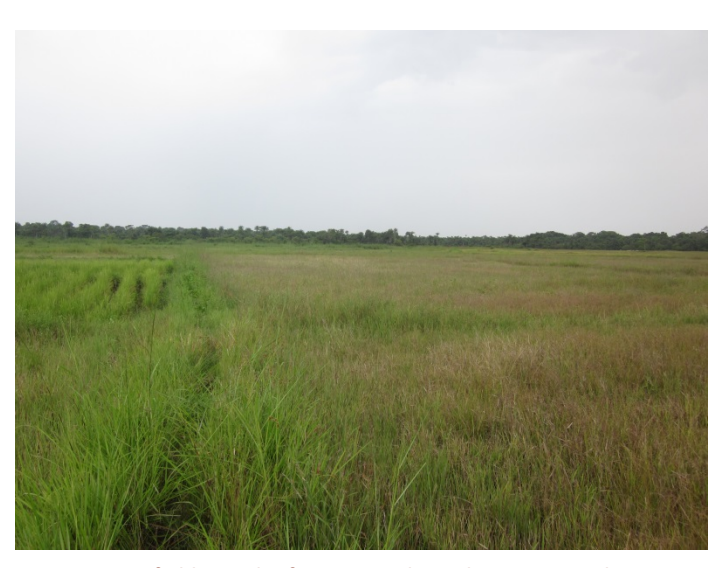
Figure 19 Ricefields south of Ponta Gardete; there were no harvest activities yet and for that reason no godwits.

and north, falling in in the area near Blom. We prepared a campsite along the road to Bula and spent the night there.