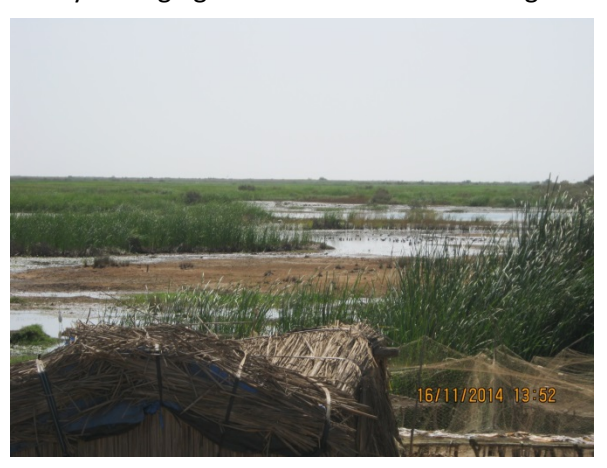
Figure 12 Ndiui. This location kept open from Typha by local fishermen to use for fishery. A small flock of godwits used this place to forage.

Today we left at 8:30 our camp area to cross the border again between Mauritania and Senegal. It was possible to cross the border at the Diama dam between 10:00 and 11:00. At 9:30 we arrived at the dam and with help of Zeine we could leave Mauritania and enter Senegal without any problems. Only 20 minutes later everything was arranged and we were free to explore Senegal again. Around 10 o'clock Khady, Idrissa Ndiaye (free-lance ecological consultant) and the driver Medoune Diop picked us up and we started to explore for godwits immediately. The first place we checked was the area south of the Djoudj where we saw in total around 50 birds mostly foraging on Chironomids during the