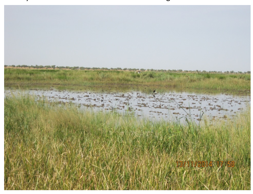
Figure 5 Small scale rice fields in the Tocc-Tocc Reserve. More than 95% of the fields were not harvested yet but this small field was first harvested and a small flock of godwits used it to forage on rice.

much success. Only 20 Godwits were present in a ploughed rice field, but we could not check for rings. More than 95 % of the rice unsuitable fields was for foraging godwits because no rice had been harvested yet and we think it will take another month before they will start cutting Figure 5 . We saw also >240 Spoonbills and read a Dutch scheme combination; also about 120 Ruffs present. We finished the day close to the Djoudj Biological Centre where we found a flock of 52 with a Y5bird that is regular visitor of this site; on the roads towards the center we only seen uncut, large-scale, mainly recently devellopped ricefields. Just