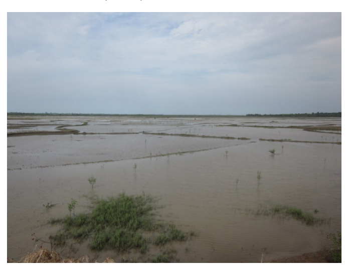
Figure 23 Flooded rice fields due to a dike break close to Ensalma

flew in the direction of Ensalma. We called it a day and slept at Hamilton's place in Bissau.