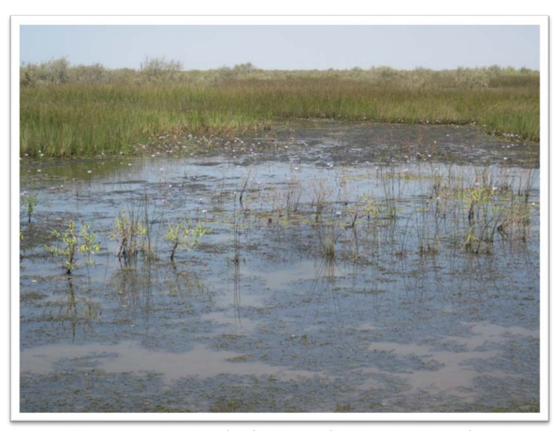
Figure 9 Bell basin in NP Diawling; This artificial floodplain gets flooded in July and changes from a dry area without vegetation into a swamp.