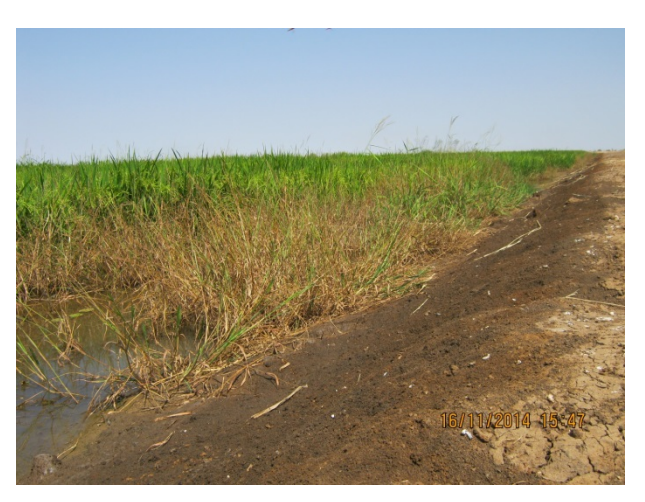
Figure 11 The edge of ricefields are used by Ruffs that forage mostly on grass seeds of Echinochloa pyramidalis and 'wild rice seeds'.

read one CR-combination due to long distances.