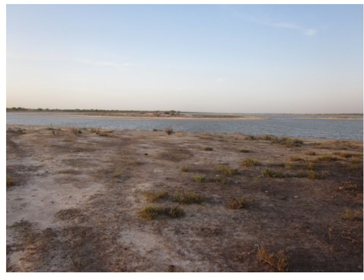
Figure 1 The brackish flood plains of the Senegal river; in July this fills up with sea- and rainwater.

rain water Figure 2. Due to less rainfall this year and problems with sand blocking the water supply, the area had already dried up substantially but even in a very dry year as this (2014), there are still some major waterbodies available. The water comes in during the rainy season in July-September but before May it will dry out completely leaving behind a film of salt that is being harvested. In wet years big areas are covered with water. We saw around 170 Godwits and read 1 ring combination (code flag). Also we found 55 Spoonbills and read 2 rings (Spanish). We were accompanied by the warden Pape. After that we went to Mouit where we spent the night at the camp of the guards (Mussa is in charge there).