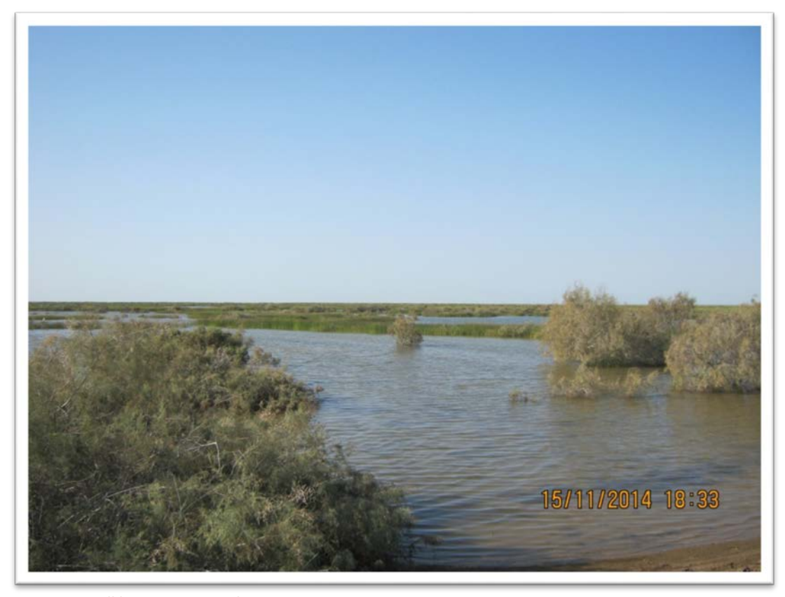
Figure 10 Bell basin in NP Diawling