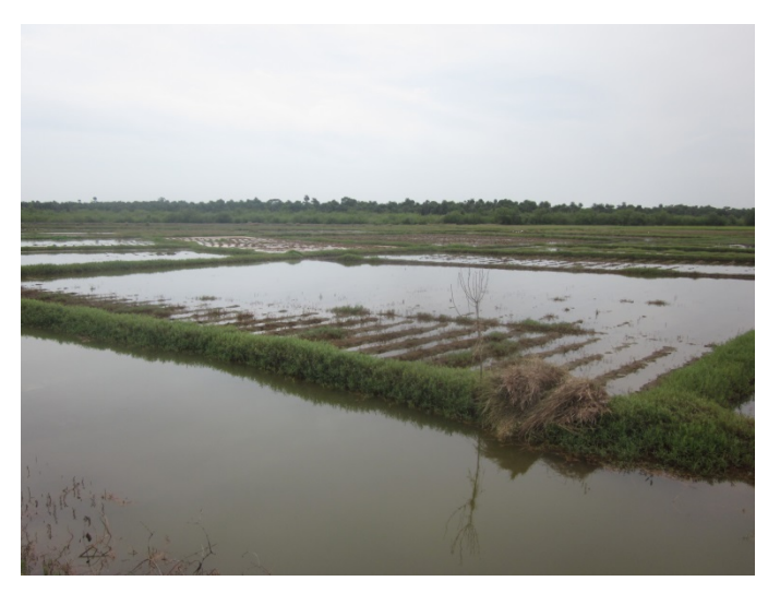
Figure 26 Quintungul. Marginal fields on the edge of mangroves were 800 godwits foraged and roosted.