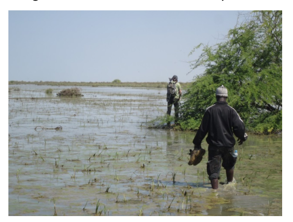
Figure 8 Limited access to the most important site in the Diawling; the location was only reachable by a three kilometer walk partly through water.

foraging on Chironomids Figure 7 . It was possible to walk towards them on the mudflats but they were skittish and flew up together with the huge flocks of Garganey that used the area. But we followed the group as good as we could and managed to read the first 2 resightings for Diawling of BTG and also 2 Dutch Spoonbills in a group of 150 individuals. Reading rings was difficult, not only because of the limited access but also due to vegetation limiting visibility of the birds Figure 8 . In the afternoon we had good views of both the Bell and Diawling basin via the main dike/road which are mostly covered by an open marshland vegetation with open water in between. Although this seems suitable habitat we only saw a few godwits and max 100 Ruffs. They can be numerous but we have not seen many in the past few days,