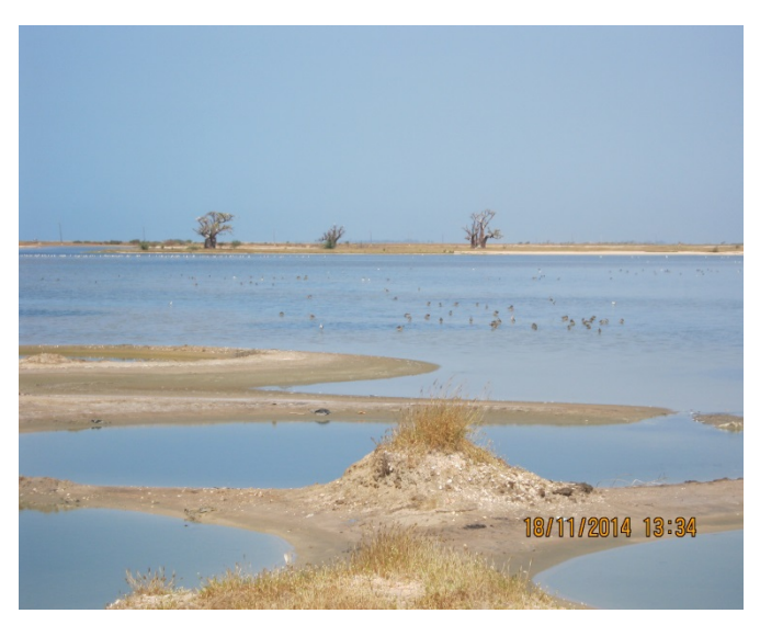
Figure 17 Palmarin. Salt pans used by godwits.