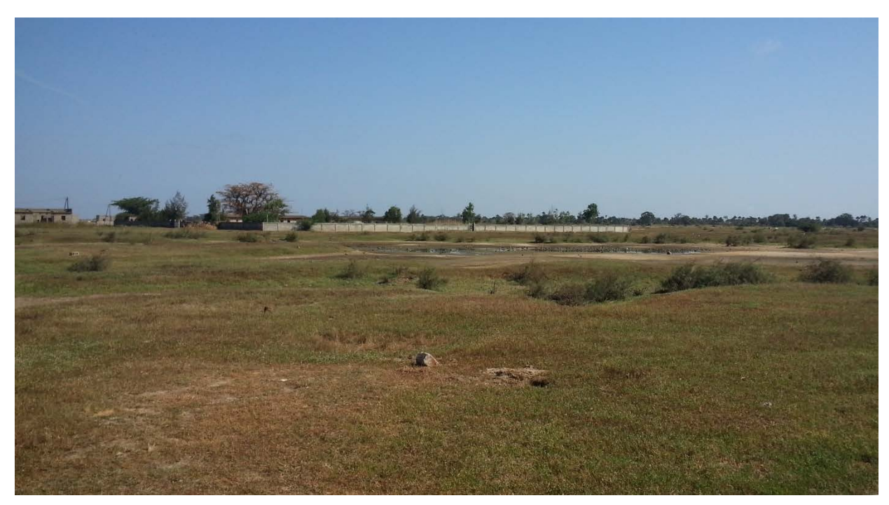
Figure 16 Palmarin. Godwits resting and probably drinking in the end of the morning at this fresh water pool in urban area.

day. In the morning we found several groups (in total +/- 500 birds) under excellent observation conditions but ring density was low. But on the way back to Dakar we found a big group of 500 birds near Joal under perfect light and water level conditions and we ended the day with 28 resightings, doubling the number seen in Senegal and Mauritania! On the way back we dropped of Khady near Thiès and Idrissa in a Dakar suburb and thanked them for the perfect cooperation and organization. In Dakar we spent the evening ordering our faeces and seed samples (including the 40 samples Idrissa had collected in October) and writing up.