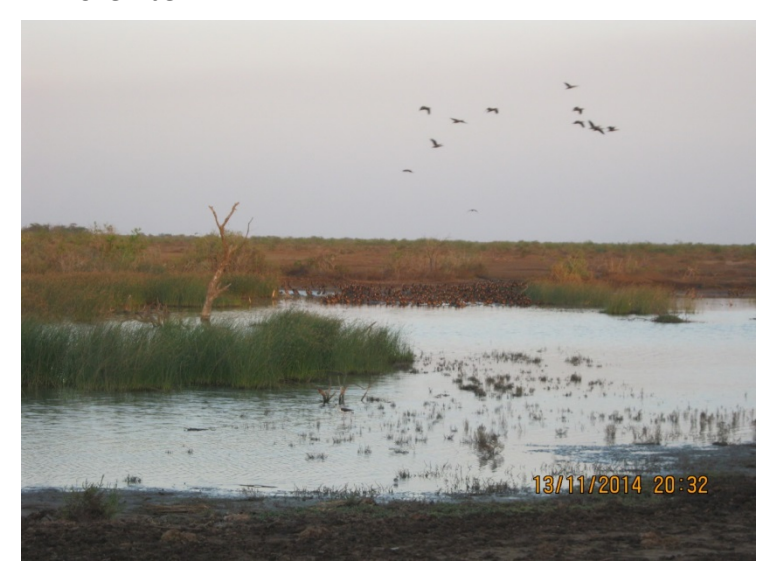
Figure 6 Flood plains in National Park Djoudj. This area Marigot du Khar is an important winter site for White-faced Whistling Ducks ( Dendrocygna viduata ), but also small numbers of godwits were present.

Today we had breakfast at 6:30 and we went to the field at 7:15. We checked the Marigot du Khar where we saw yesterday around 200 Godwits. There were only 25 birds present now, but we were lucky and found 3 cr combinations. All 4 birds we saw in the Djoudj so far, were already observed in previous years which is a clear indication that this is their regular wintering site. Another bird had been observed in the Guembeul area last year; perhaps it escaped the drought there? At 9:15 we left and traveled to the border at Rosso where we arrived at 10:45. We crossed the river by boat; the