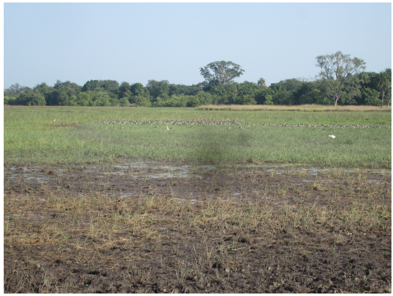
Figure 28 Thanks to Hamilton we discovered this place at Mansoa. 2000 Godwits were actively foraging in wet grasslands and grazed mudflats.

We also collected some faeces samples. We headed for Pache to set up our camp site that we reached at 21:30.