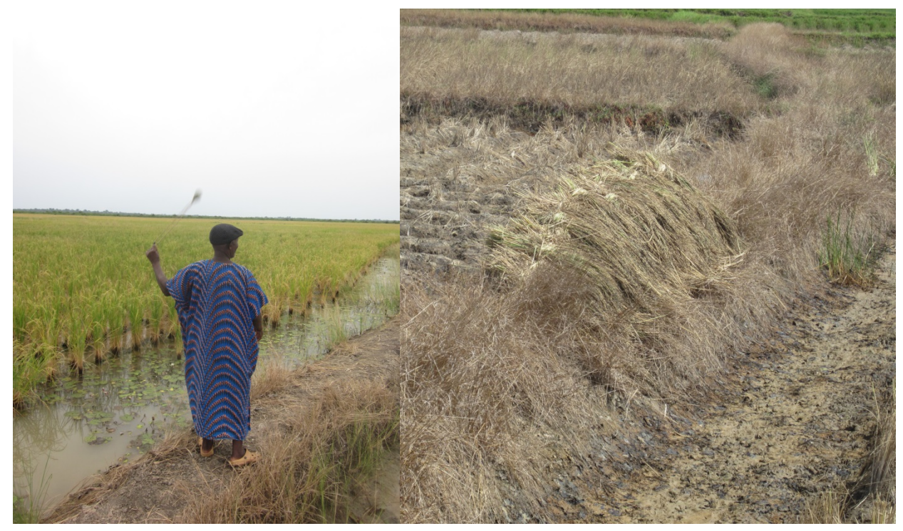
Figure 21 Harvested rice in Pache Iala (right). Rice needs to dry on dams before it is collected and brought to the village. Godwits can forage on this drying rice with a high success rate. Locals try to avoid this by scaring them with sounds and stones (left).

Ring reading was not easy because the birds were mainly foraging between the rice plants or stubble and good sights were prevented by the dykes; we could most of the time not approach them close enough before they flew up. We set up our campsite in the village next to the ricefields.