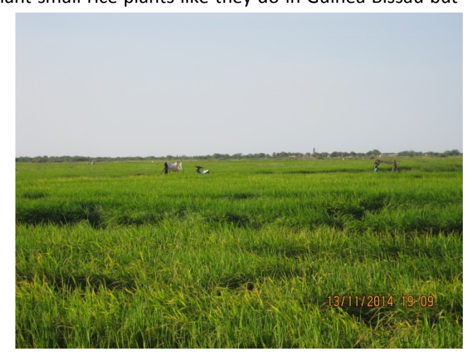
Figure 13 Intensive ricefields at the Djoudj owned by French companies.

Figure 11. At 12:00 we drove to the western edge of the Reserve of Ndiael where we found no Godwits: the place was dried out completely. During the trip we saw a lot of intensively managed ricefields; at these fields they harvest rice twice a year during