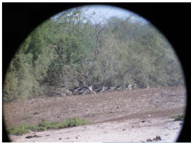
Figure 4 right: Godwits actively foraging on Chironomids at Toug.

lagoons SE of St Louis, Leybar (eastern part) and Khor (western part). There were a lot of salt water waders but no godwits although Khady has seen a few thousand on the northern edges of the lagoon in recent years; but this year is too dry/ salty(?) for them apparently. At 19:00 we did a roost count at Ngaye-Ngaye: 360 birds, which is probably the complete wintering population in the area.