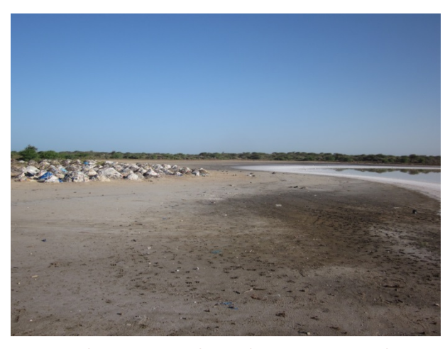
Figure 3 Salt pans next to the road; in some years godwits forage here but in a dry year as 2014 the biggest parts dried up already and no godwits were present in November.

Today we learned that big parts of the PN de Gandiol/ Guembeul have already dried up due to lack of rain and sand filling up the canals towards the Reserve Figure 3. At Toug we found a group of 65 BTG and read 1 code flag. All birds we saw in the reserve are actively foraging, probably on Chironomids. After a while they started to forage in dry sand dunes where they actively picked in the ground. We found out that they were probably foraging on grass seeds Figure 4. At Ngaye-Ngaye we found the bigger group again with 265 birds but >95% is foraging in belly deep water and we saw no rings. We tried at several other places in the Guembeul Reserve without luck. After lunch we lookedfor birds at the St Louis sewage plant where we saw 15 birds. We looked for birds in the big