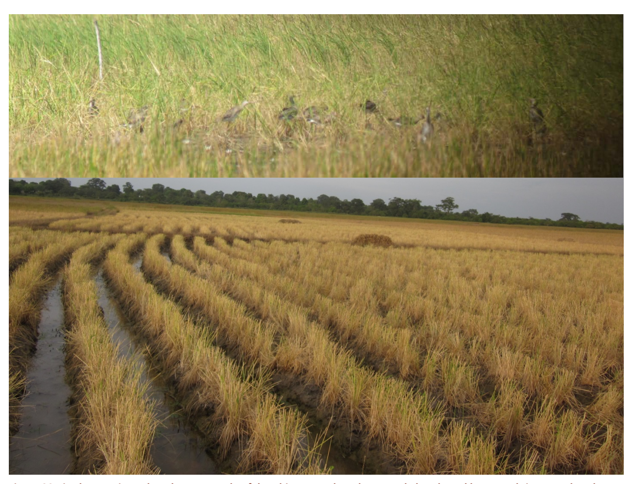
Figure 29 Rice harvest in Pache Iala. In a couple of days big parts where harvested already and harvested rice was placed on piles. Godwits foraged partly in harvested fields (under) but also in low-productive parts (above).

We used our last morning in the field to check the Pache Iala-area once more. The group we encountered earlier this week was still present and had even increased to around 1500 individuals. This area was so attractive for them because they have started harvesting and in the central part of the valley is a wet area with low-productive wet rice fields which they mainly use to roost during the day. The local Balanta-farmers try to scare them off but this is very low profile Figure 29 . Because of that, the birds can be observed from a fairly close range. Our yield this morning was 18 birds from our scheme. After a final meal we headed for Bissau where arranged the financial aspects of this mission with Joazinho Sa, head of Wetlands International in Guinea Bissau. At 22:30 we went to the airport to check-in even though our scheduled departure time was at 3:40 but check-in was apparently only possible till 0:00.