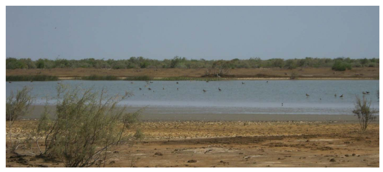
Figure 14 Small flocks of godwits at Tiguet.

This morning we scanned the southern half of the Djoudj NP. We found a group of 310 individuals in the Marigot du Khar and read 4 CR combinations and a Dutch Spoonbill. BTG were again all actively foraging in fairly deep water. Along the edges of the big central lake of the NP we only found a handful of birds but 10.000's of ducks and a distant group of 3000 Spoonbills. Ruffs were hardly seen, no more than 150 individuals. We continued our search along the SW dike in the direction of Tiguet Figure 14 . We found about 50 individuals in small groups or solitary. Are these perhaps using a different foraging strategy? At 13:00 we had to leave to go to Palmarin where we arrived after an exhausting 9 hours drive.