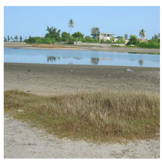
Figure 18 Godwits were actively foraging on the tubers of Enteropogon prieurii, an abundant grass species on the edges of the lagoons and saltpans.