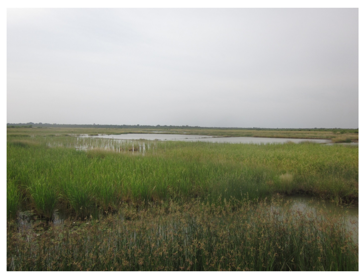
Figure 25 Possible roost place for godwits at Blom, but only a couple of godwits were present at sunset.

later in the afternoon was rather disappointing with only a maximum of 40 birds that were mainly foraging till sunset Figure 25 . We saw however some groups flying further west but who knows where the roost is? Before the roostcount we made a quick visit to Quintungul but saw no birds; <10% had been harvested and we saw no open spots suitable for godwits. Campsite at Blom.