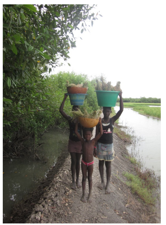
Figure 27 Transporting rice from the fields at Quintungul.

Bucomil were we found a complex of flooded rice fields due to a breakthrough of the dike but no